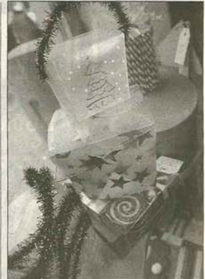
TAKE TWO: Chinese-food take-out cartons from Rugg Road .

selection of silk-screened miniature gift cards ($4.95/eight) with Christmas, Hanukkah, and seasonal imagery, including a stunning silver tree on a background of snow white and blue. Dress up wine and sparkling cider with Bowl & Board's brightly colored cotton bottle bags ($6). Small gifts look so much greater in Rugg Road Paper Company's vellum Chinese-food take-out cartons ($2.25-$5.75), which come printed with red Christmas ornaments and other holiday images. The shop also sells felt gifts bags , such as a gray bag ($9.95) decorated with leaves and smaller, brightly colored versions ($6.98) decorated with a Santa, a snowman, or an ornament.