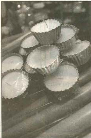
LIGHT FARE: cupcake tea lights from Black Ink.

Here, you'll find suggestions on where to find such goods priced at around $10 to create your own gift cache. But before you ring up a bunch of items, keep in mind that you don't need to tote gifts around just in case you're ambushed by someone bearing an unexpected present. "Rather, give a gift in return, if you'd like, at the next social occasion or natural gift-giving time that you share with this person," recommends Ingram, "such as when you go to their house for dinner or when you're attending a neighborhood holiday party all together."