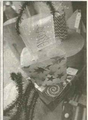
TAKE TWO: Chinese-food take-out cartons from Rugg Road .

selection of silk-screened miniature gift cards ($4.95/eight) with Christmas, Hanukkah, and seasonal imagery, including a stunning silver tree on a background of snow white and blue. Dress up wine and sparkling cider with Bowl & Board's brightly colored cotton bottle bags ($6). Small gifts look so much greater in Rugg Road Paper Company's vellum Chinese-food take-out cartons ($2.25-$5.75), which come printed with red Christmas ornaments and other holiday images. The shop also sells felt gifts bags , such as a gray bag ($9.95) decorated with leaves and smaller, brightly colored versions ($6.98) decorated with a Santa, a snowman, or an ornament.